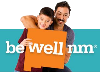
beWellnm Enrollment Pattern